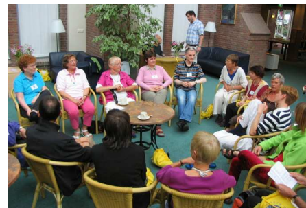
photo right: spontaneous singing; under: challenge show with free (loving and caring) attention for those who performed.

trainers exchanged their experiences at Donkerbroek in Friesland