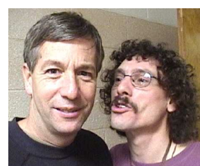
the co-ordinator of CCI